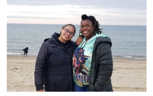
Sharing memories through the frequent changes that mark youths' experience in foster care.