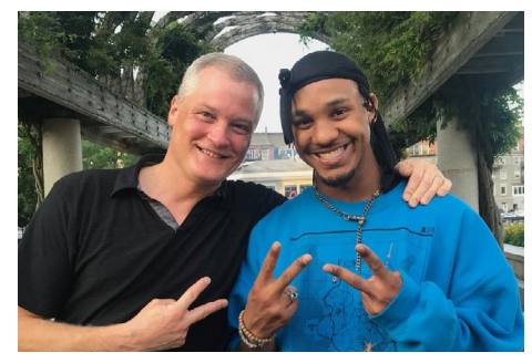
Building a trusting relationship grounded in care and respect.